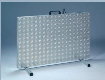
Option: Two Feets